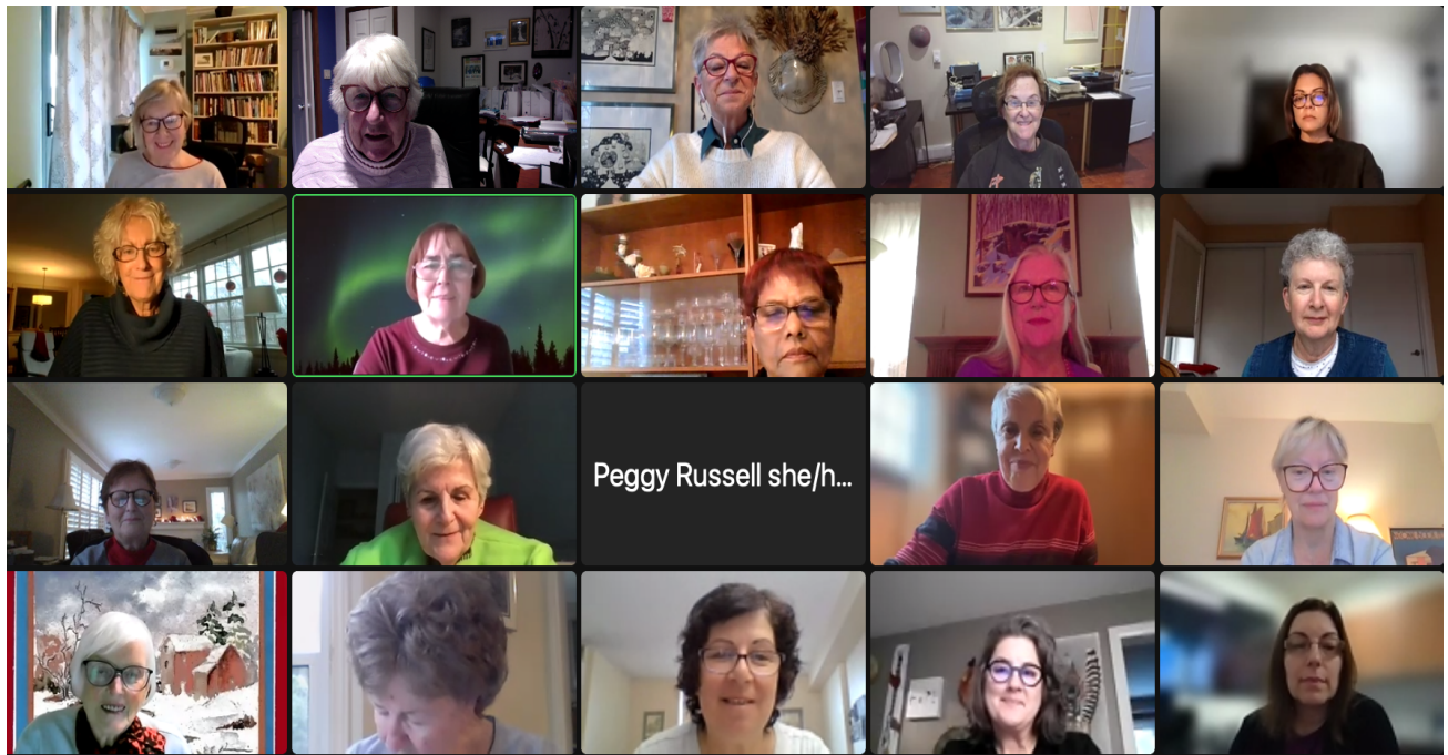
Our Fall 2022 meeting

Newsletter of Advancement of Women Halton